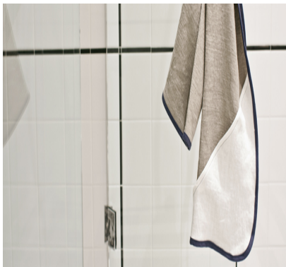
Linen Hooded Baby Towel